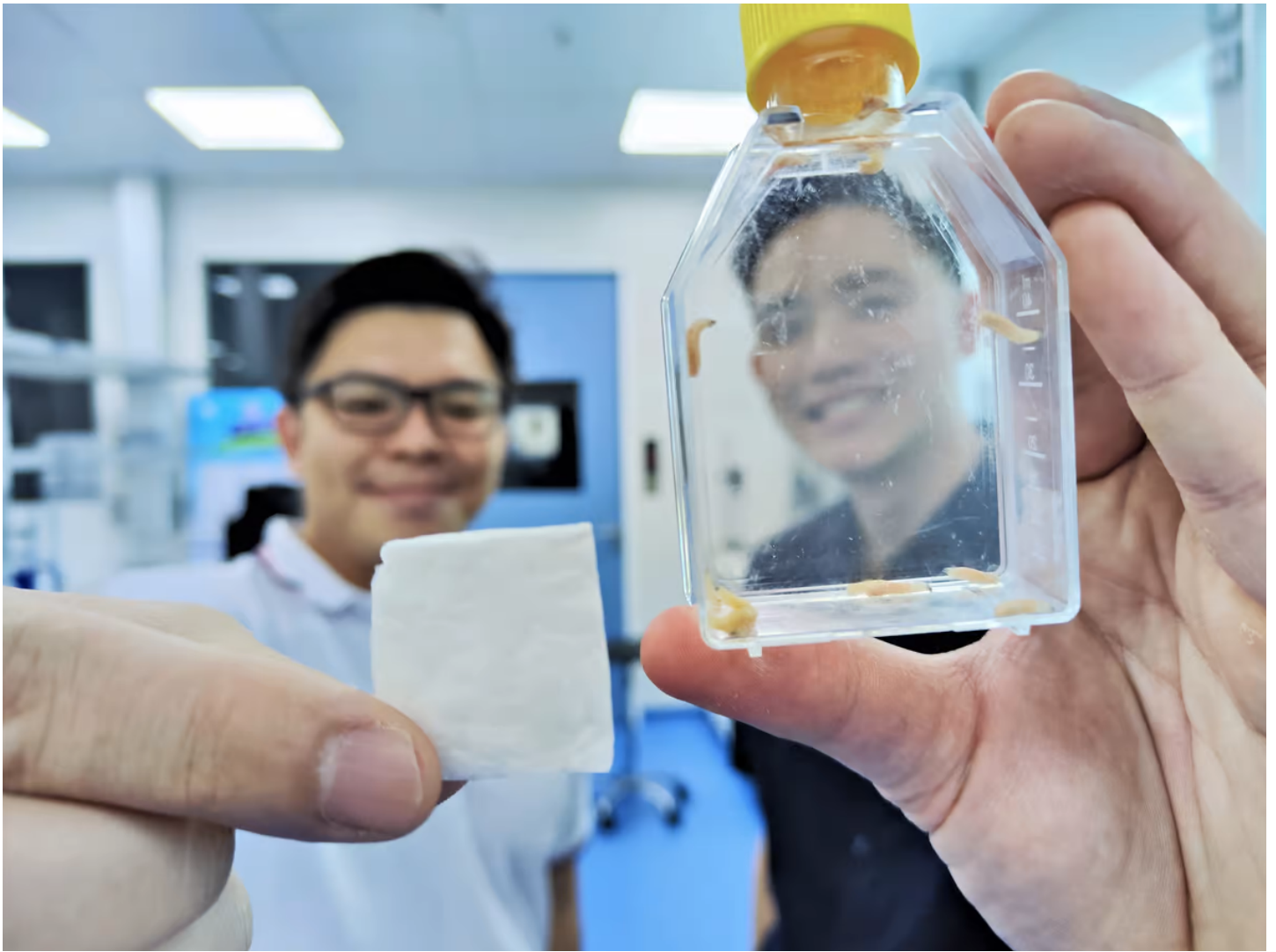
The frog-derived collagen patch (left) is intended to be used with a wound treatment solution that incorporates live maggots (right)